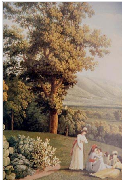
Painting depicting a landscape in the style of the English Landscaping school

The earliest gardens in the colony developed a method of gardening called "squared" - it was based on the simple geometry of straight walks, shrubberies and hedges. Like the architecture of the period the gardens followed a straight forward, ordered formula made impressive by its simplicity.