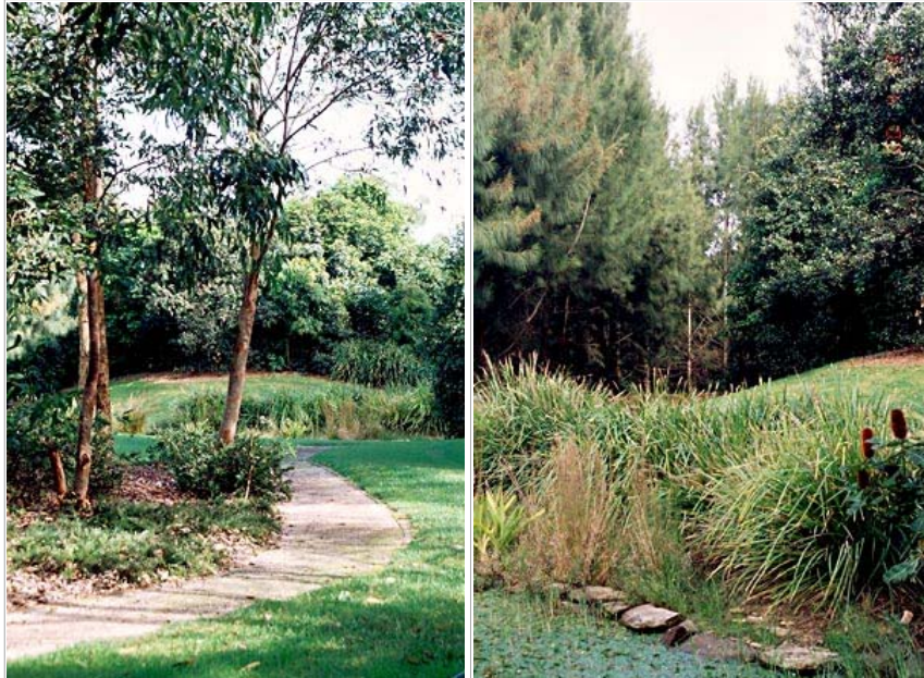
Cockburn garden, Dural, New South Wales. Designed by Bruce McKenzie

In Australia in the 1980s, conservation and the environment remained relevant and gardening with native plants did not. Possibly plant and garden design choice was affected by the Postmodern influences of nostalgia and retro design. The "native gardens are a jumble of dry sticks" school of thought gained popularity, as the Australian plant gardens of the 70s often failed to thrive and look suitably gardenesque, due in the main to the misguided perception that a native garden meant no maintenance.