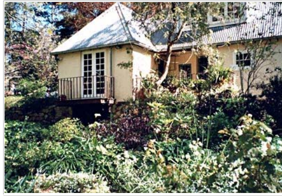
Bickleigh Vale, Victoria.

Vale, envisaging a village of simple cottages and gardens complementing the natural bush landscape. Like Castlecrag it was a Modernist expression - a practical approach to conservation management in a residential environment. To Edna, houses should be simple, comfortable affairs and have an organic affinity with their site. Local materials should be used in the construction and the houses extended into the landscape by the use of walls, terraces, pergolas and the like.