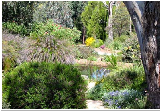
Jacob garden, Victoria.