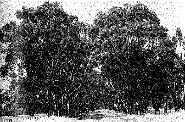
Avenue of Honour, Kotupna. One of the few examples using native trees.

In the absence of satisfactory assessment methods, landscapes submitted to the Register accumulate, awaiting processing. In 1987 only 15 landscapes, compared to 1500 buildings, were registered with the Heritage Commission. The method of assessment developed in this study involved describing a "typical avenue" which formed the basis for a type profile. The type profile was then refined by a panel of ten experts using an iterative questionnaire which then became the standard against which avenues in Victoria could be compared. On the basis of this comparison, Avenues of Honour were determined to be of National, State or Local significance.