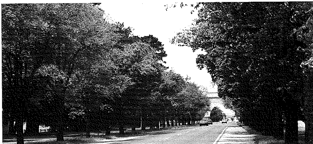
Avenue of Honour, Ballarat. Originally 14 miles long, consisting of 3912 trees.