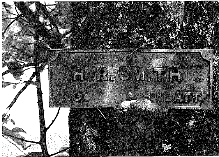
Name plaque at Skipton.