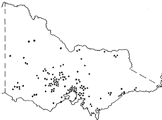
Map 1: The distribution of Avenues of Honour in Victoria.

The complete significance of Avenues of Honour may not be fully appreciated by contemporary Australians, but they are appreciated for their aesthetic qualities and historic interest. The challenge, then, is to develop an objective method of landscape assessment which will ensure that the most significant Avenues of Honour are placed on the Register of the National Estate and conserved.