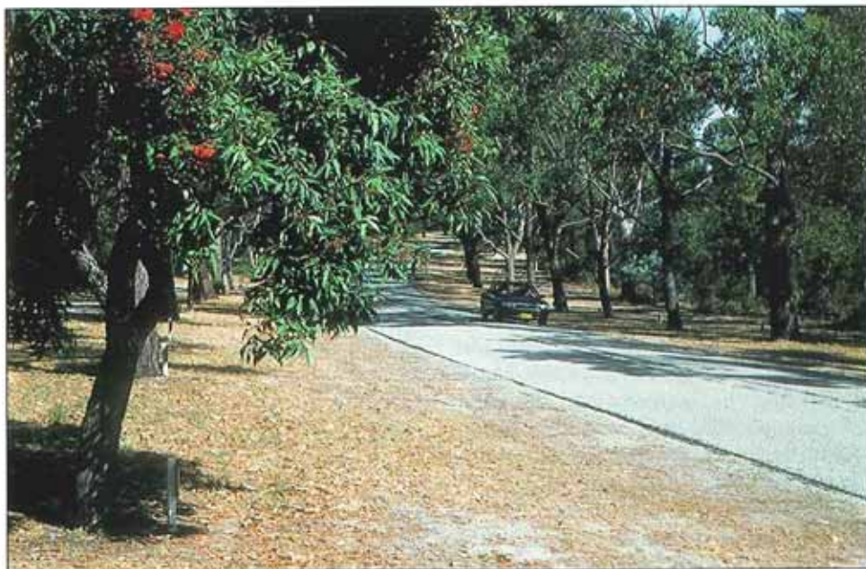
May Drive, Eucalyptus botryoides planted in 1940, except for some subsequent replacements with Eucalyptus calophylla and its variety rosea , of which the first tree on the left is a specimen.