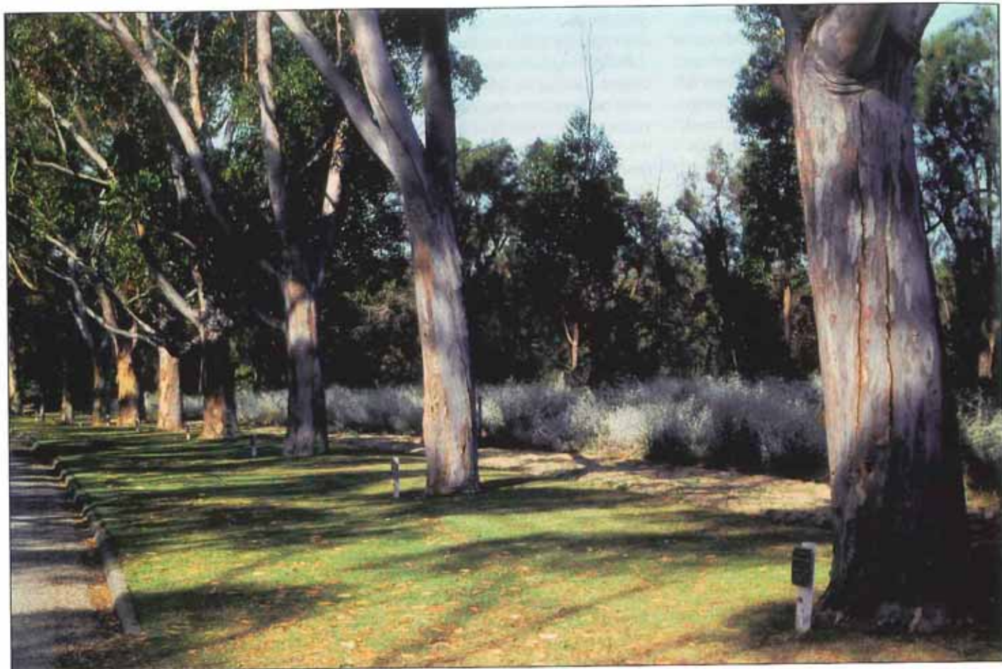
Lovekin Drive, Eucalyptus cladocalyx planted in 1932.

"A classical symbol of power has become a modern metaphor for community"