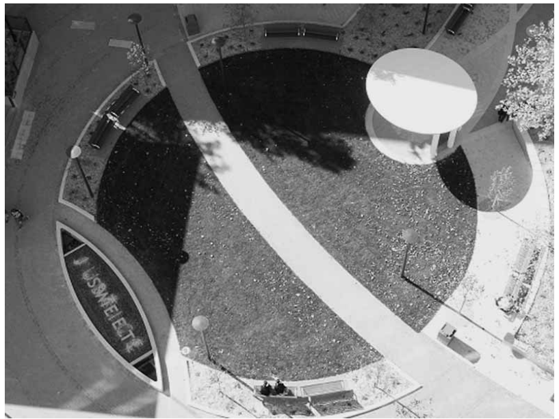
Hobart Place Redevelopment, West Civic Canberra DSB Landscape Architects, Canberra

The site for the staging of the inaugural ACT awards cocktail evening, 26th March 2004