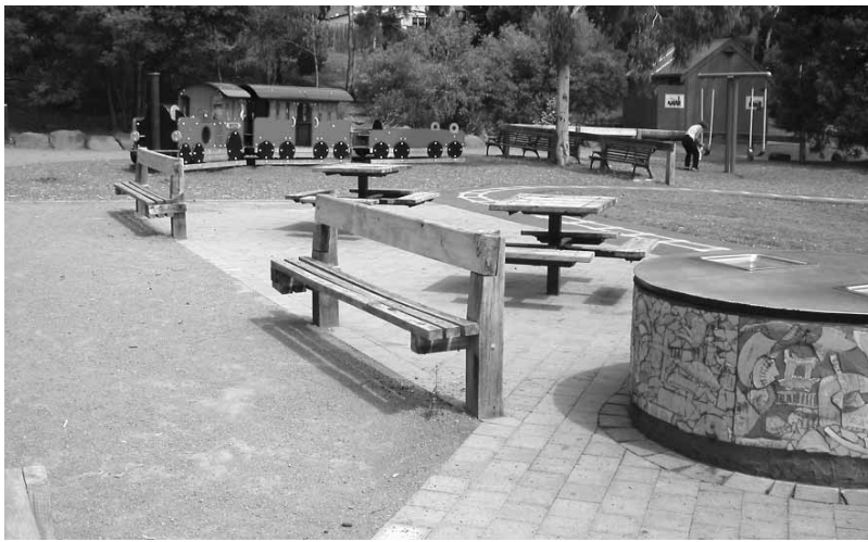
Caldew Park Playground

Another one of those small local sites that on the surface probably look like just another playground. However, as is the case with this one, they come packed with layers of wonderful stories about how the project was developed, community involvement and the challenges that had to be overcome by landscape architects.