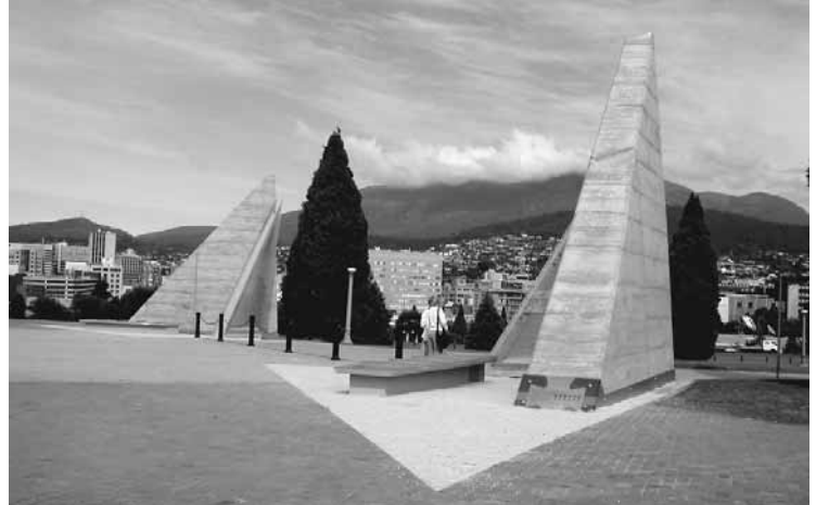
The award winning Victoria Cross Memorial, Hobart Tecton Projects, Hobart City Council