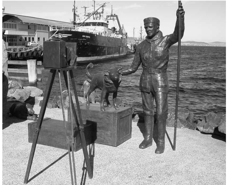
Mawson sculpture on Hobart wharf

The Awards Presentation will be held at the award dinner, Friday 1 st October, as part of national conference in Brisbane.