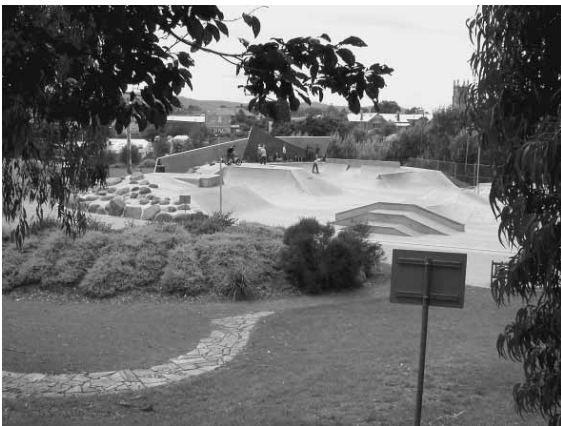
The now very popular skate park within North Hobart Cultural Park