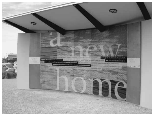
Migration Wall within North Hobart Cultural Park Tecton Projects, Hobart City Council