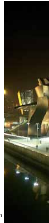
Front cover: Guggenheim Museum, Spain