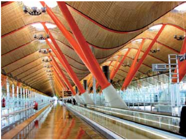
Confronting Heathrow yet again made our entry into Madrid all the more stunning. How can an airport be made to be such a pleasurable experience?... by excellent design it seems, enhanced with a playful flamboyance. Note the colours of the spectrum used as a persisting theme. Barajas Airport, Lord Richard Rogers...