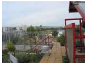
Photographs: Christie Walk