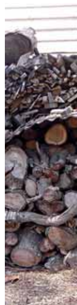
Cover: Wood store, Westwyck