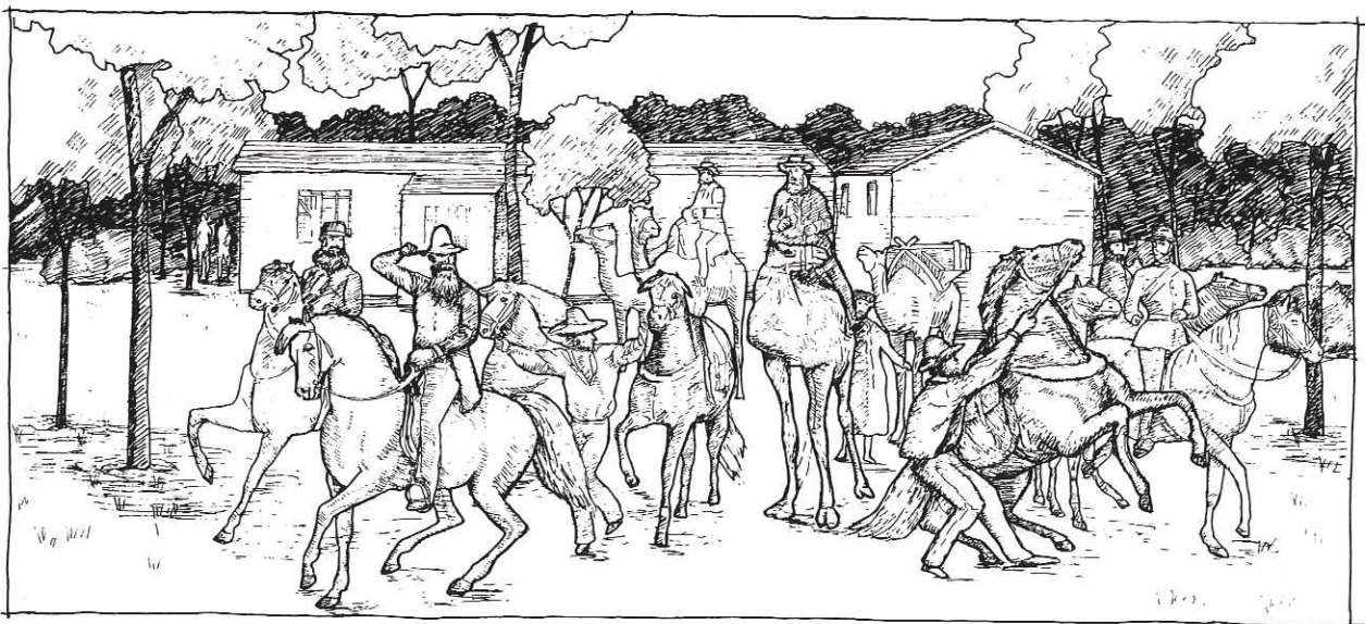
Burke and Wills expedition party memorial sculpture.