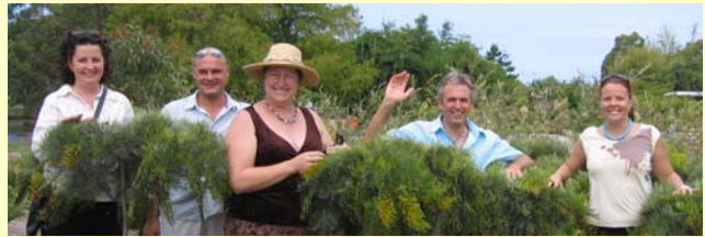
Fun amongst topiary Grevillea launching AILA GOLD