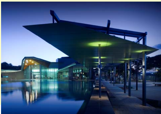
Thuringowa Riverway Commendation for Design in Landscape Architecture 2007 AILA QLD Project Awards

Check our website for all up coming event details and registration Visit us at: www.aila.org.au/qld