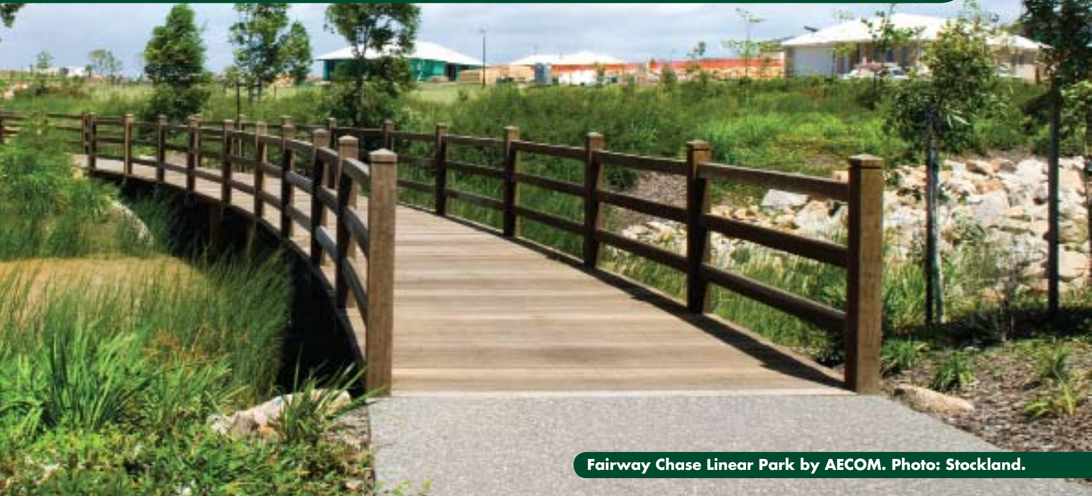
Fairway Chase Linear Park by AECOM.