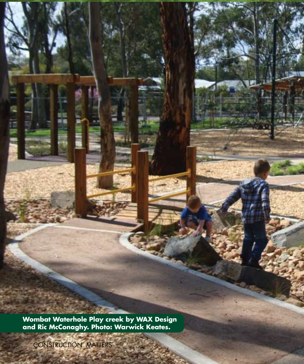
Wombat Waterhole Play creek by WAX Design and Ric McConaghy.