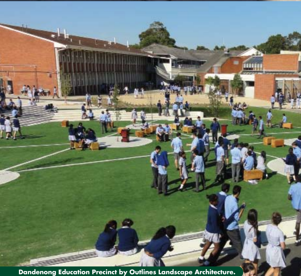
Dandenong Education Precinct by Outlines Landscape Architecture.