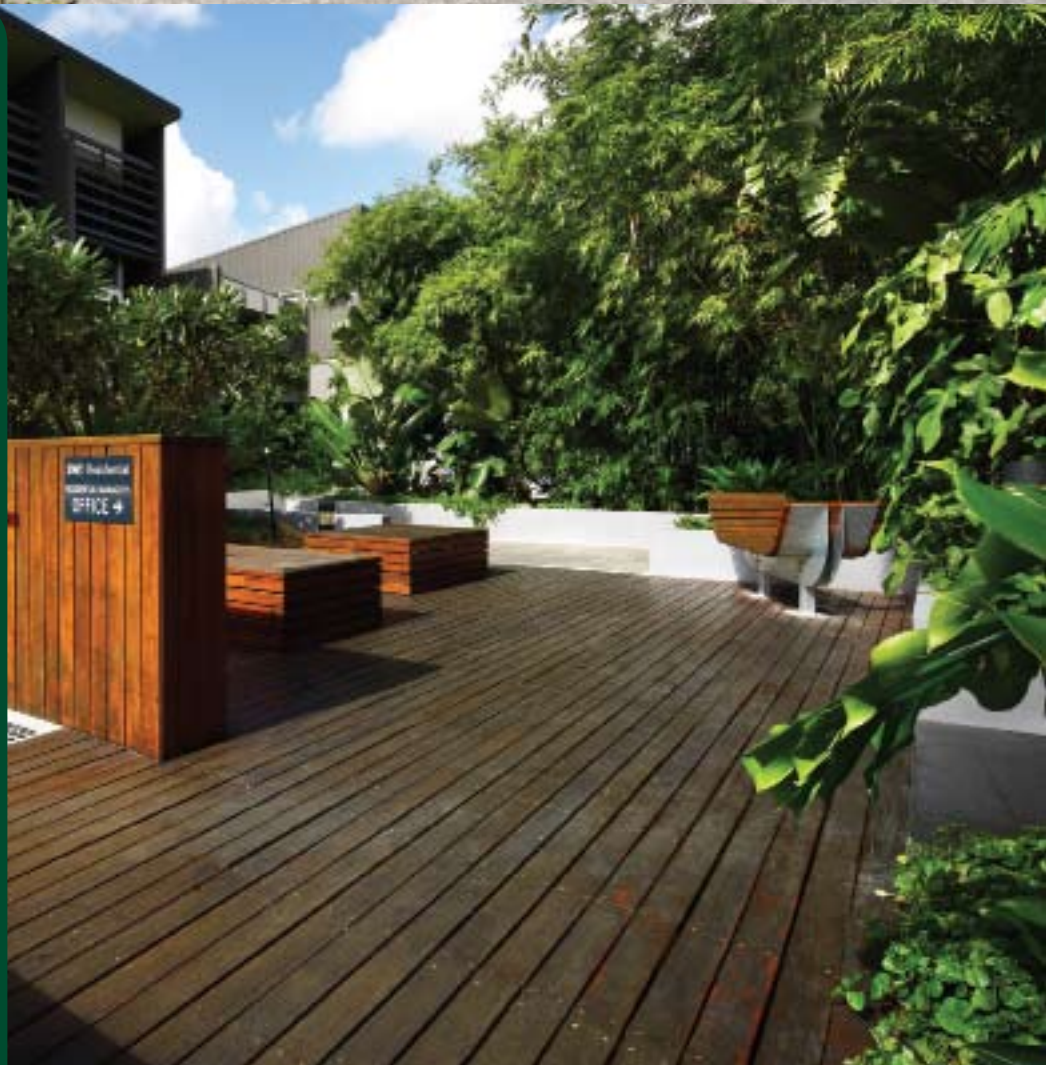
SW1 by Gamble McKinnon Green. The landscape is experienced by users as shade canopies, cool tiles, rich timbers, lush arbours, fluid street plantings, and draperies of green.