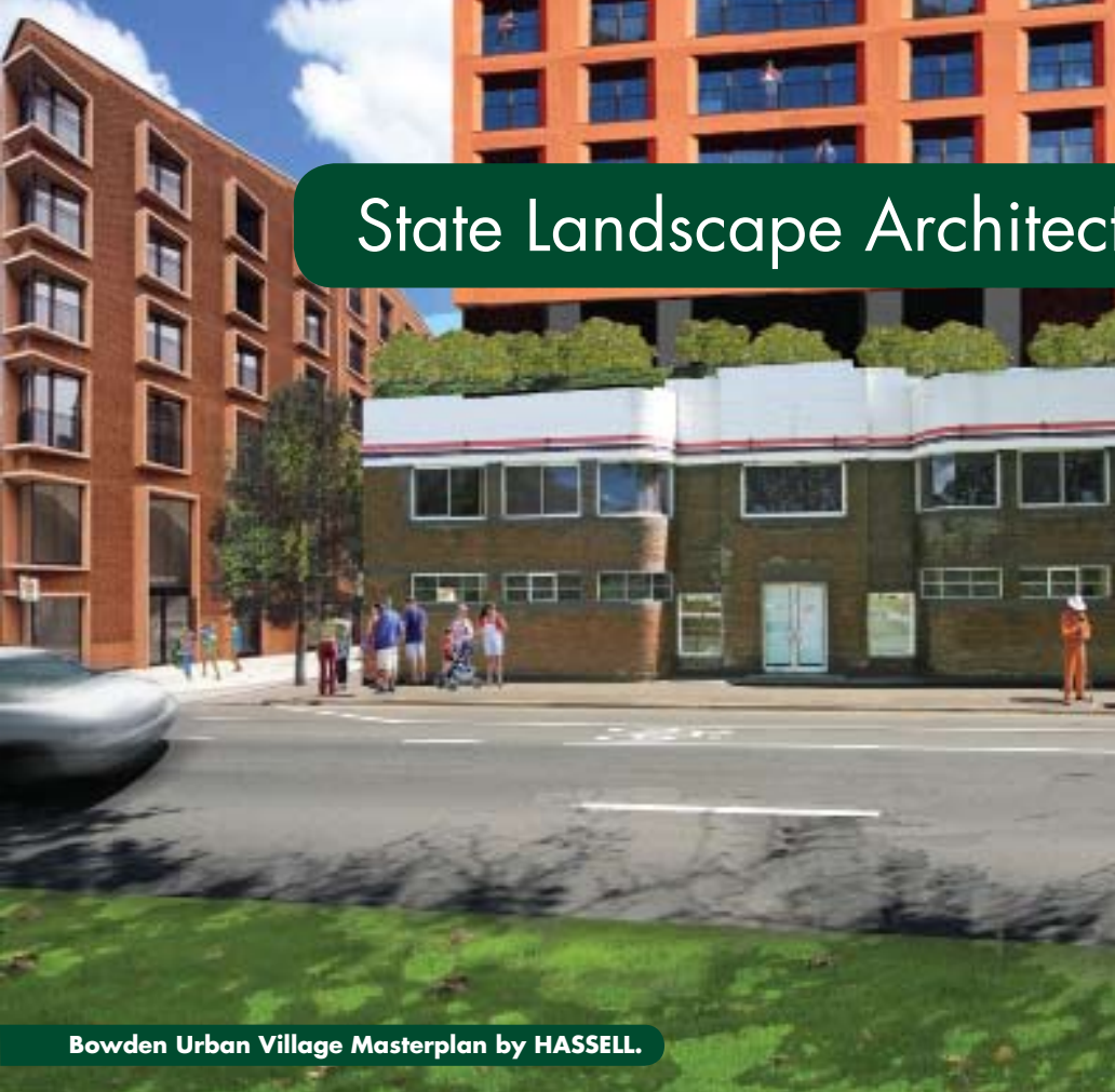
Bowden Urban Village Masterplan by HASSELL.