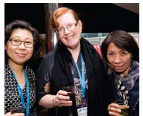
Above: Delegates from EAROPH enjoy the sites of Adelaide.