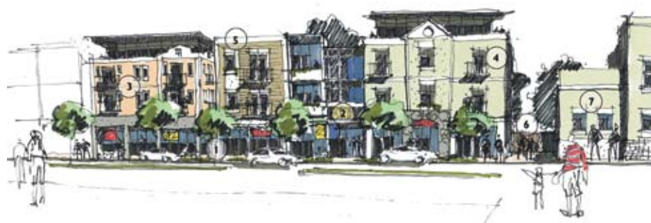
Woodville Village Masterplan: Indicative building styles along Woodville Road