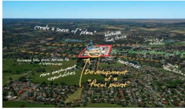
Mount Barker Town Centre Review; Community Engagement Strategy