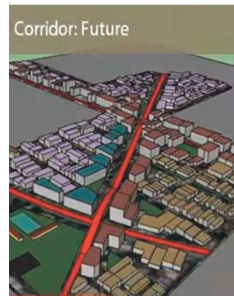
Goodwood Road Transit Corridor Rezoning Project