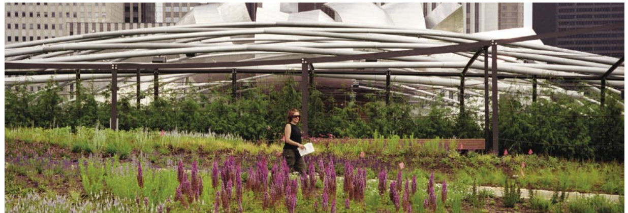
The Lurie Garden, Millennium Park.

Her advocacy extends beyond traditional landscapes to include transportation corridor planning and design through leadership in statewide support for Context Sensitive Solutions. Astrid spoke at the first Security Design Coalition Conference in 2003 for "Safe Spaces: Designing for Security and Civic Values", advocating a sensible balance between security measures and preservation of public access to public places, and on a similar subject recently at the 2005 Canadian Society of Landscape Architects' Annual Congress.