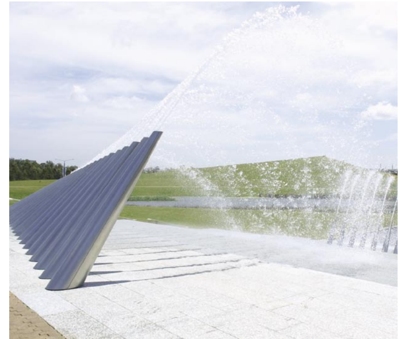
The Northern Water Feature, Sydney Olympic Park

Due to the extensive ongoing use of Bicentennial Park for picnicking and casual recreation, an additional destination was required so that the parklands at Sydney Olympic Park become Sydney's premier recreational destination. Wentworth Common has been identified for this purpose. An important objective of the new work is to ensure that an effective and robust planting scheme was implemented. The aim is to make the venue distinctive as a physical and visual entity. This implies that the outcome of the planting design will present to the visitor a sense of uniqueness distinguishing this as a special destination.