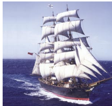
The James Craig Historic Tall Ship

Star City's proximity to Darling Harbour ensures guests may completely relax and enjoy the evening, with only a short walk to hotels at the end of the night.