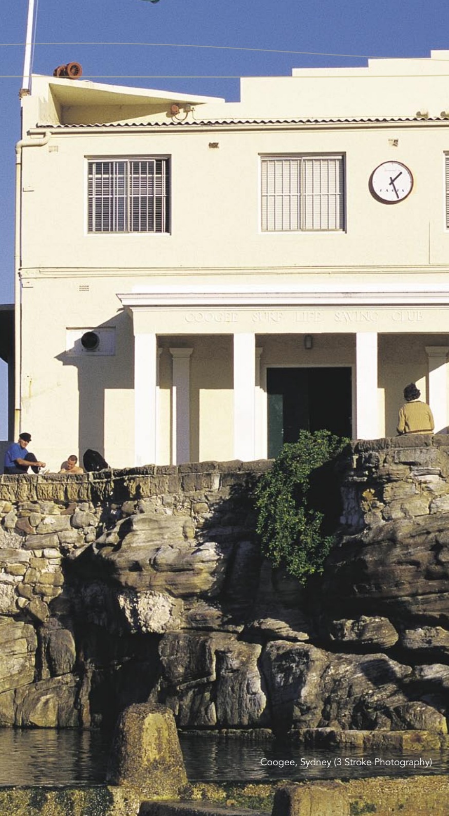
Coogee, Sydney