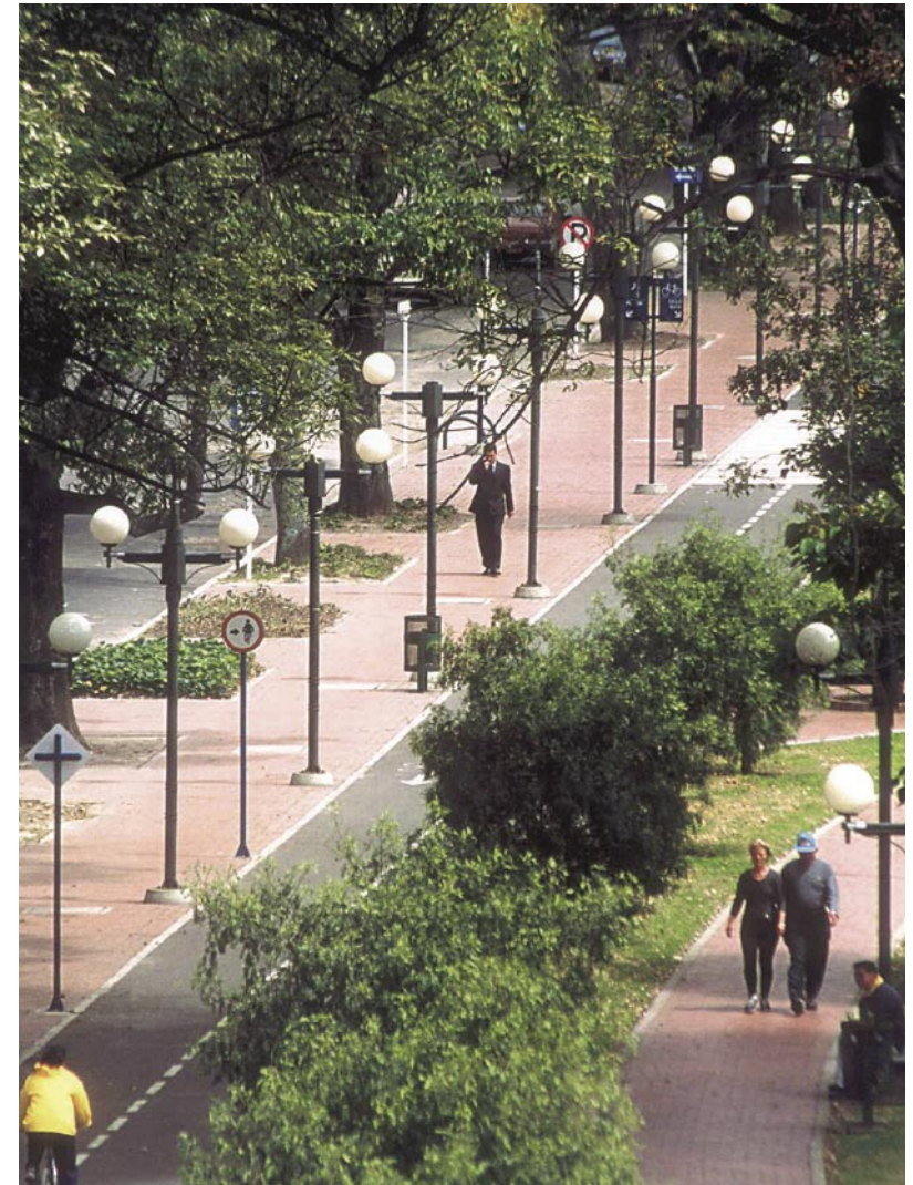
CicloRuta, Bogotá: The Bogota Transformation included the development of a large network of cycleways; CicloRuta was planned as a means of countering the city's massive reliance on cars in favour of a more sustainable system of urban mobility and has resulted in a significant shift by citizens towards bicycle use.