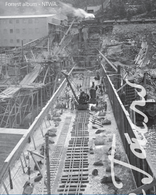
Forrest album - NTWA.