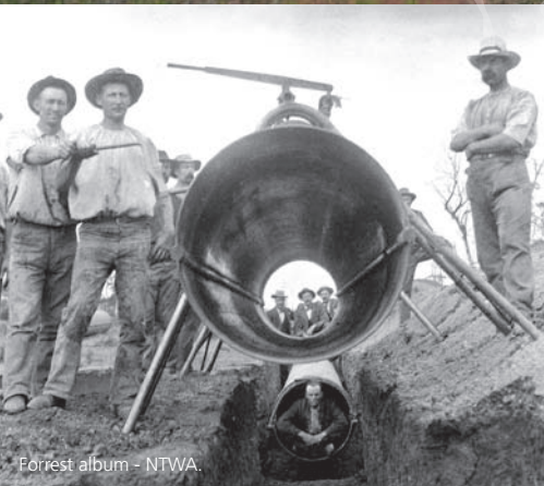
Forrest album - NTWA.

Explore the rich heritage of Western Australia's goldfields at a leisurely pace in a luxury air conditioned coach and learn why CY O'Connor's famous water pipeline was dubbed a 'scheme of madness'. Discover the political intrigues and personal tragedy, explore the natural bushland and old steam stations, find the remnants of boom and bust towns that form part of the goldrush.