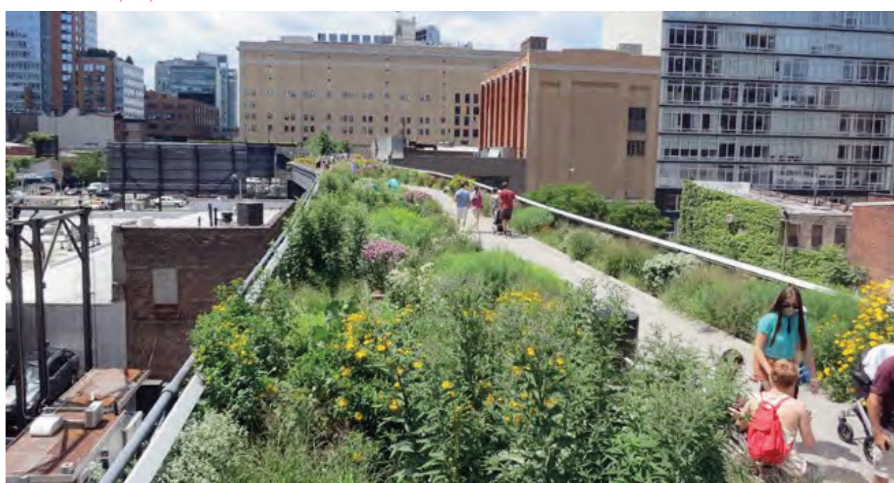
The High Line New York

With the publication of the Australian Infrastructure Audit , and the upcoming planned release of the 15 Year Australian Infrastructure Plan, AILA believes the Federal Government is poised to a take global leadership position and formally acknowledge our natural landscape as a key infrastructure asset for Infrastructure Australia, and one that has a tangible impact on creating a higher quality of life for Australians.